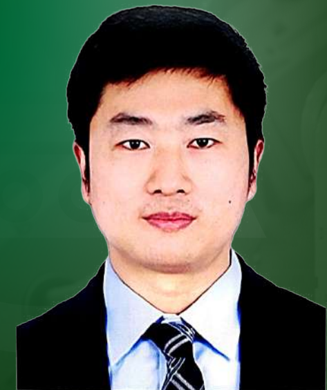
Mr. Flander Fan

Assistant Deputy Minister for industrial competitiveness and advance manufacturing - Minister of Industry & Mineral Resources (MIMR)