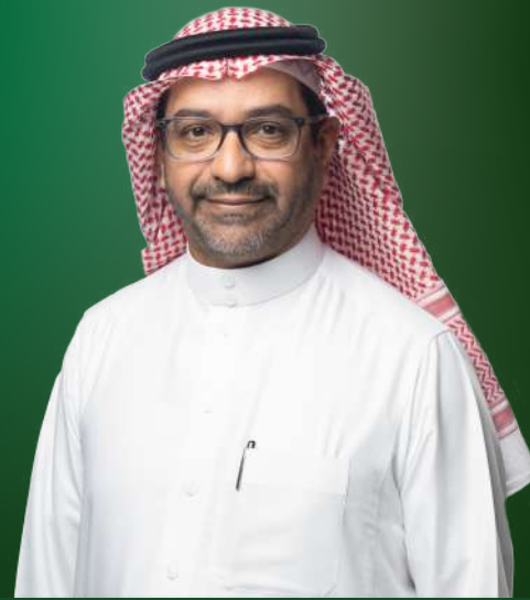
Eng. Saleh Al-Solami

Vice Minister of Industry & Mineral Resources for Industrial Affairs - MIMR