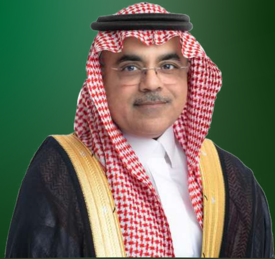
H.E. Eng. Khalil Bin Salamah

Vice Minister of Industry & Mineral Resources for Industrial Affairs - MIMR