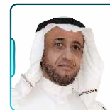
Mosaed Al Garni Former Deputy Minister